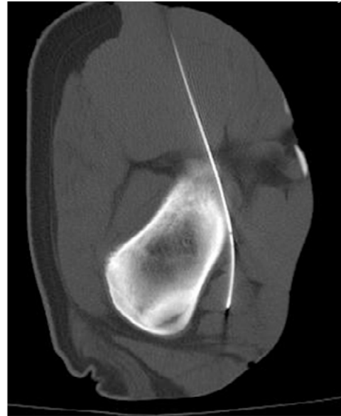
Morrison Steerable Needle™ used for sampling, rounding the bone and carefully avoiding neurovascular bundle