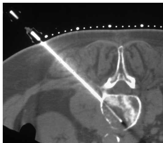
Use of Bonopty® Penetration Set and Bonopty® Biopsy Set to sample a lytic lesion with bone structures in lumbar vertebrae.