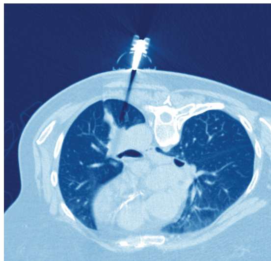
SeeStar® aids the physician by producing an artifact in the CT image, indicating the intended needle path.

AprioMed provides tools that enable physicians to optimize precision and control during the most challenging procedures. For more information about AprioMed's Interventional Radiology products please visit www.apriomed.com .